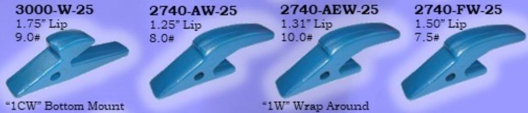
"1CW" Bottom Mount