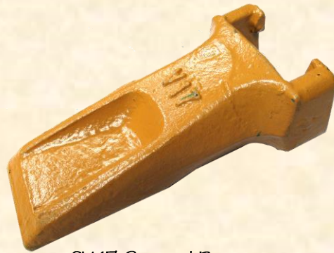
CV-17 General Purpose 2.9#