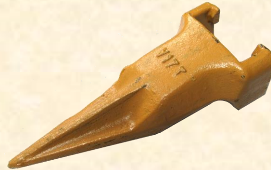
CV-17T Single Tiger Sharp (Same as V17YY) 2.4#