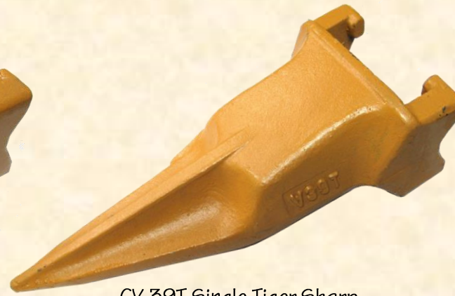
CV-39T Single Tiger Sharp (Same as V39VY) 18.9#