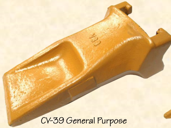
CV-39 General Purpose 22.3#

H&L "Cobra Line" CV-39 Series Teeth fit all field OEM Style Super-V Adapters.