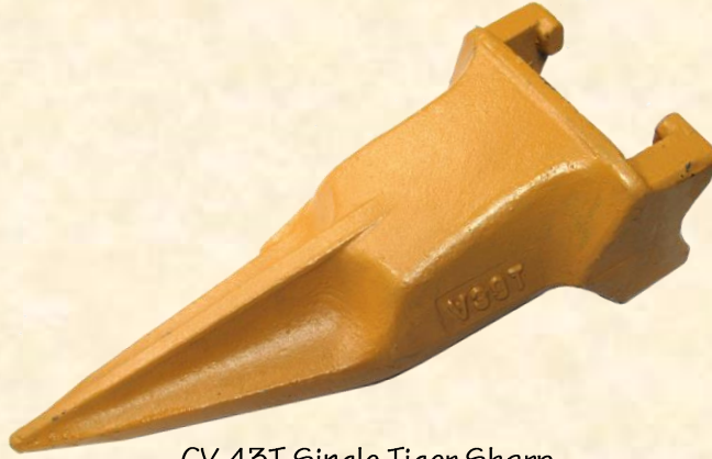
CV-43T Single Tiger Sharp (Same as V43VY) 28.3#

H&L "Cobra Line" CV-43 Series Teeth fit all field OEM Style Super-V Adapters.