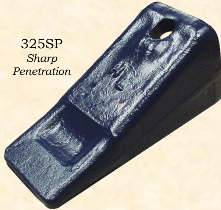
325SP Sharp Penetration