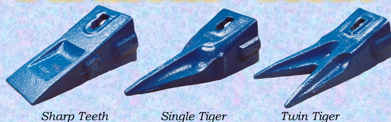
Sharp Teeth Single Tiger Twin Tiger