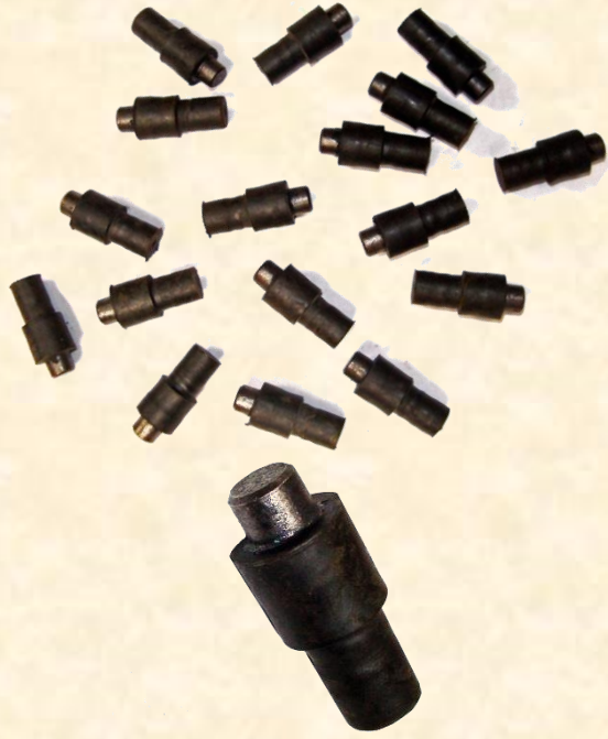
H&L Part #3-SLP Snaploc