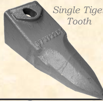
Single Tiger Tooth