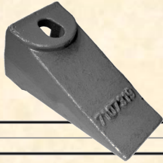
Short Impact Tooth