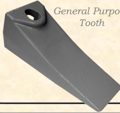
General Purpose Tooth