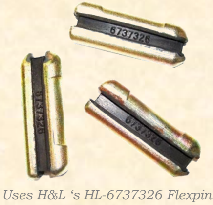
Uses H&L 's HL-6737326 Flexpin