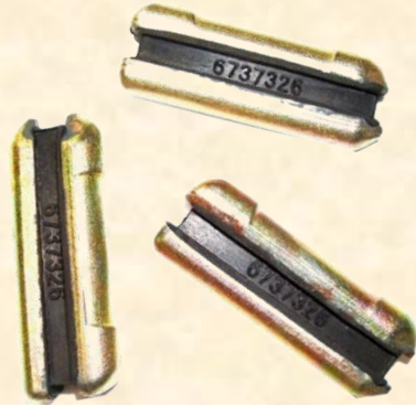
Uses H&L 's HL-6737326 Flexpin