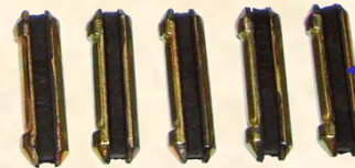
230RT REMOVER TOOL

230DFP or 23DLFP available for the asking