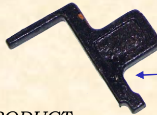
← 230RT REMOVER TOOL