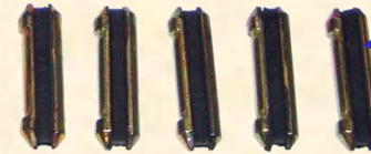
← 230DFP FLEXPIN