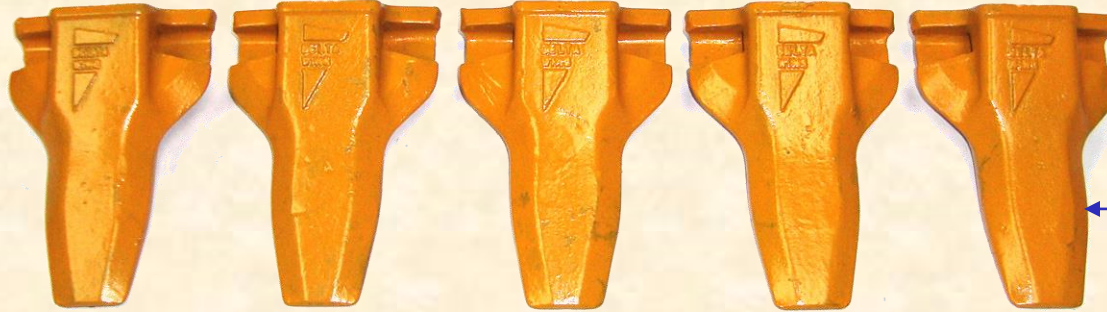
← 230HD-5 DELTAWING TOOTH

Kits also include five-(5) 230DFP Flexpins® and a FREE Removal Tool!