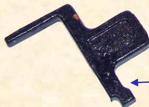
← 230RT REMOVER TOOL