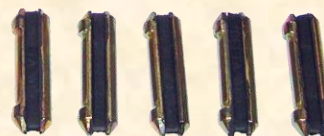
← 230DFP FLEXPIN