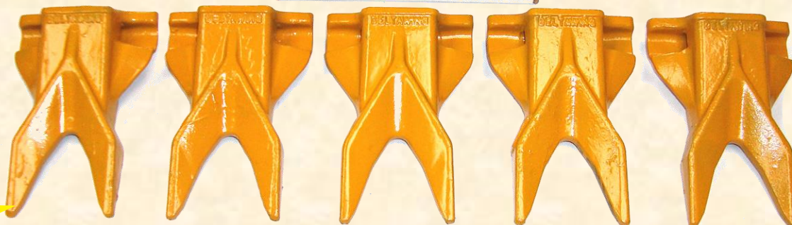
← 230TT7-5 DELTAWING TOOTH

Kits also include five-(5) 230DFP Flexpins® and a FREE Removal Tool!