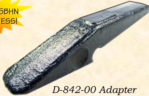
D-842-00 Adapter MAXIMUM Digging Depth