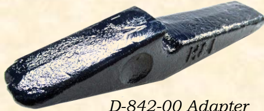
D-842-00 Adapter MINIMUM Digging Depth