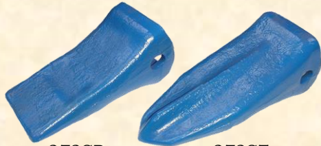
272SP Sharp Penetration

H&L's 3083-27 Stake Style Adapters are produced from aircraft quality Chrom-Moly-Nickel grade alloy steels to enhance adapter DURABILITY and TOUGHNESS!