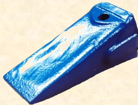
CX-160SP Sharp Penetration 5.3#

H&L offers a variety of 160 series bolt-on and weld-on adapters!