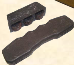
Uses the C-35 Series Rubber Insert and Steel Pin