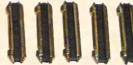
← 230DFP FLEXPIN

H&L's KIT230CHF Tooth Kits consists of five-(5) 230CHF Heavy Flared Teeth, designed in Tulsa Oklahoma for enhance tooth DURABILITY and long LASTING SHARPNESS!