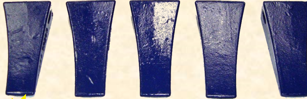
230TF FANGS TOOTH